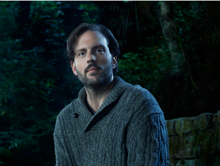
Silas Weir Mitchell

is by far his most exciting role yet. I interviewed Silas about this new hit show and also his acting career.