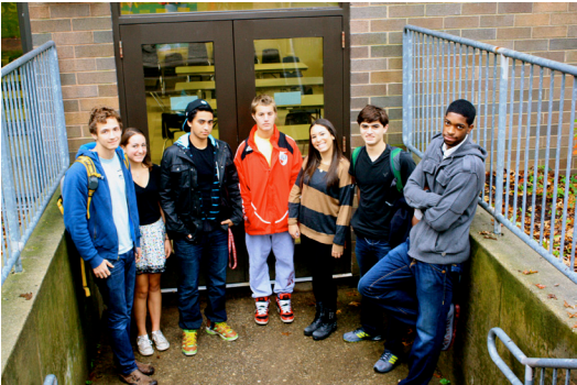
By Marielle Greenblatt ‘13

Except when the upperclassmen give you those looks. ❖