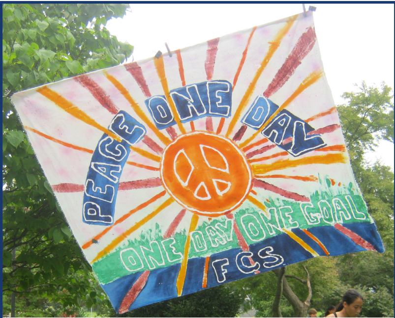
Friends' Central Peace Day Flag