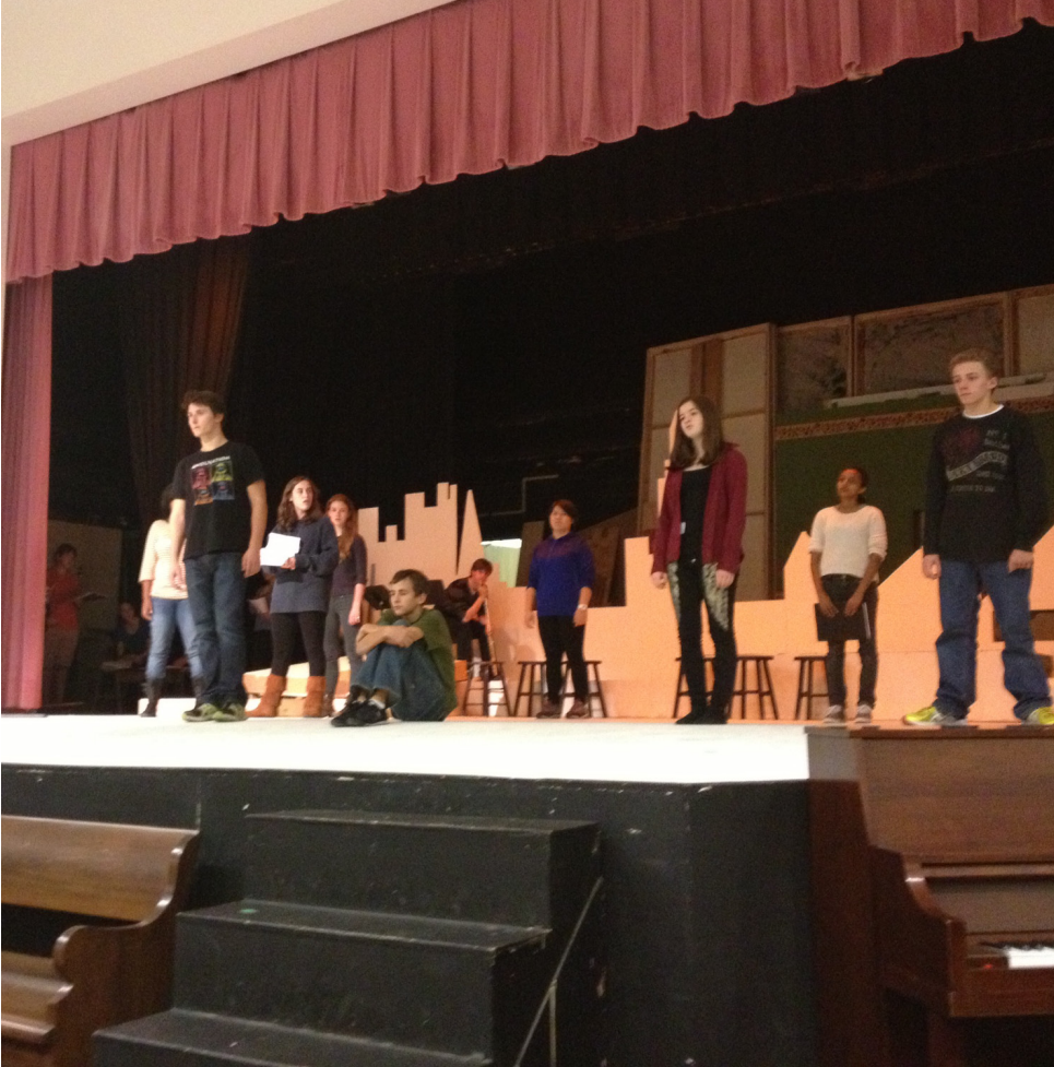
The cast of Great Expectations , rehearsing for their October 26 premiere.