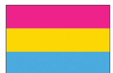
Pansexual Attraction to all genders