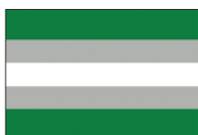
Greyromantic Sometimes desires a romantic relationship