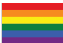
Gay Attraction to the same gender