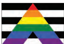
Heterosexual/Straight** Attraction to other gender(s)

Another word for attraction is desire. Sexual attraction is sexual desire, while romantic attraction (not as easy to quantify) is the desire to be romantic with someone. Romantic connection and intimate moments are what the person desires, not sex or physical closeness. Sexual attraction and romantic attraction sometimes match up, and sometimes don't. Someone could be bisexual, but homoromantic, meaning they feel sexual attraction to more than one gender but only desire to be romantically intimate with people of their same gender.