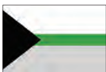
Demiromantic Someone who desires a romantic relationship after an emotional connection has formed