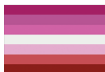
Lesbian Attraction to the same gender