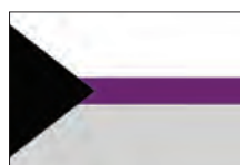
Demisexual Attraction after forming an emotional connection