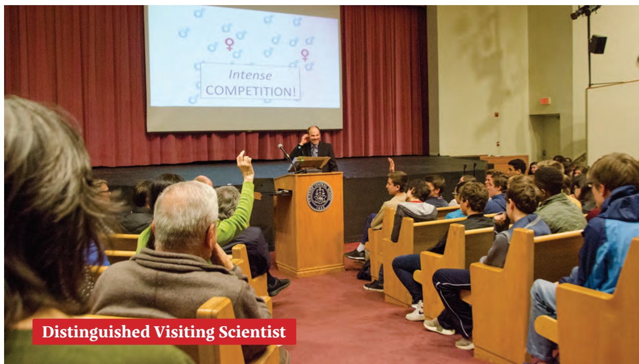
Distinguished Visiting Scientist