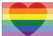
Homoromantic Desires a romantic relationship with people of the same gender