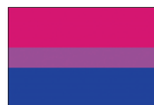
Bisexual Attraction to people of the same gender and other genders