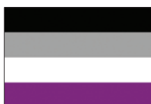
Asexual No attraction to anyone.