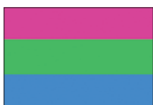
Polysexual Attraction to multiple genders