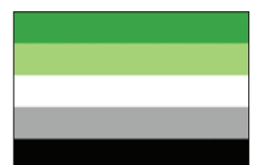
Aromantic Someone who does not desire a romantic relationship