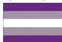
Greysexual Sometimes feels attraction, but not always